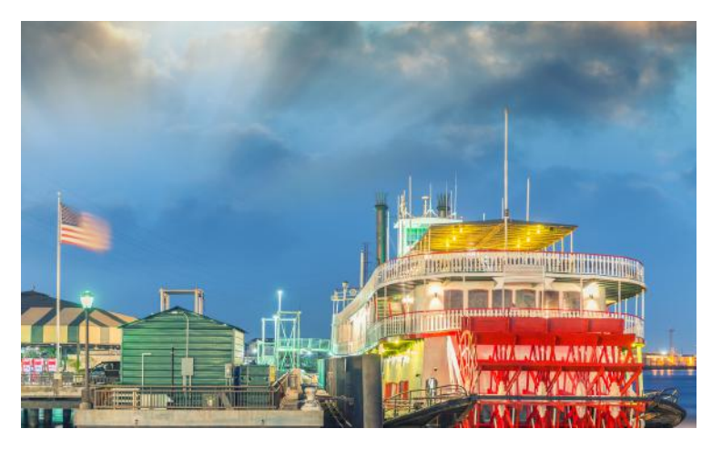
*Events and trips can also be found on the website* frontierbank.com/Clubs

Learn the history of Mardi Gras, watch artists and enjoy a slice of the famous King Cake! Next, we will head to the Riverwalk on the majestic Mississippi River. We will end the day on a relaxing Riverboat Cruise. Rounding out our trip, we will stop at the Missouri Civil War Museum in St. Louis Missouri!